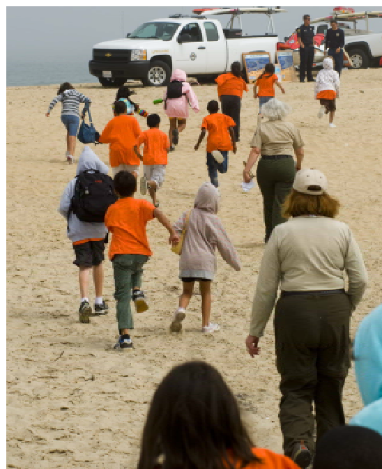
Large groups require special organization.

When group size increases, the time needed to organize the group at each stop, the transit time between stops, and the time spent clarifying issues and answering questions also increases. Since you told your audience that the walk would last a certain length of time, and the pace is generally dependent on the slowest person, your options for keeping on schedule are limited. Reducing the time spent at each stop, eliminating a stop (or stops) entirely, or a combination of both are the most obvious remedies. In any case, you will have to make a value judgment on the information you can eliminate without weakening your theme. Do not be tempted to try to make up time by walking and talking at the same time.