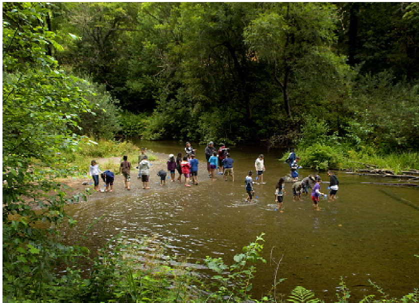
Not all interpretive “walks” take place on a hiking trail.

Your kit bag of tools for a wet walk might include clear plastic bags, shallow trays, buckets and dip nets that allow for better viewing of the specimens. Always emphasize concern and respect for the health of any animal that is captured. Make it extremely clear that you expect all things to be returned to their original setting.