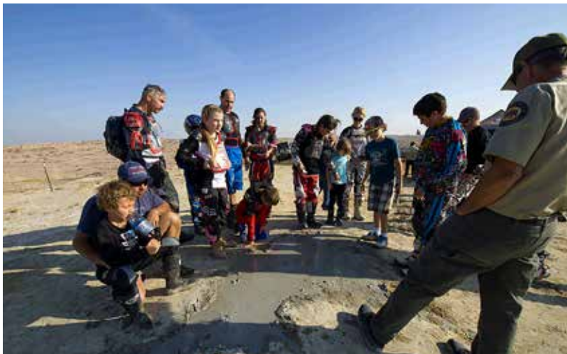
Make sure your audience can see and hear you at each stop.

feedback. Are audience members tilting their heads, moving closer, or asking others what you said? Be aware of the cues, and do not hesitate to ask the group if they can hear. Note: if you ask, “Can everyone hear me?” you’ll get a loud yes from the people in front, who can, indeed hear you. Try saying, “Raise your hand if you can hear me.” or