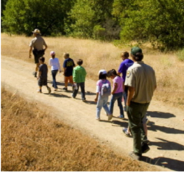
Stay in front of the group and be the leader.